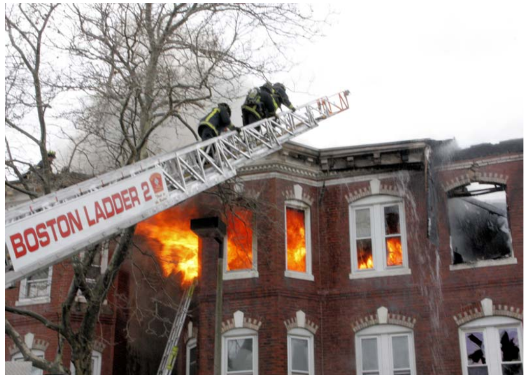
First due Ladder 2 still hard at work at 7-6167 on April 1 st on Chelsea Street.