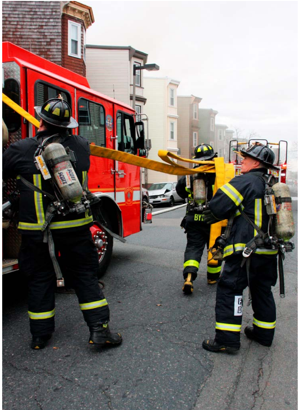
Arriving multiple alarm engine company advances a line towards the job on Chelsea St