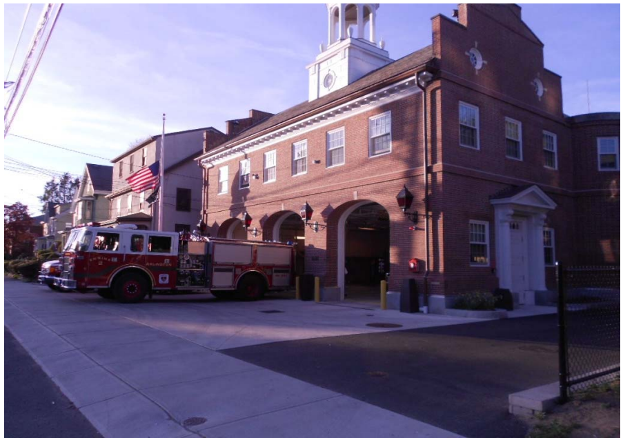
April visitation to Arlington Highland Station.