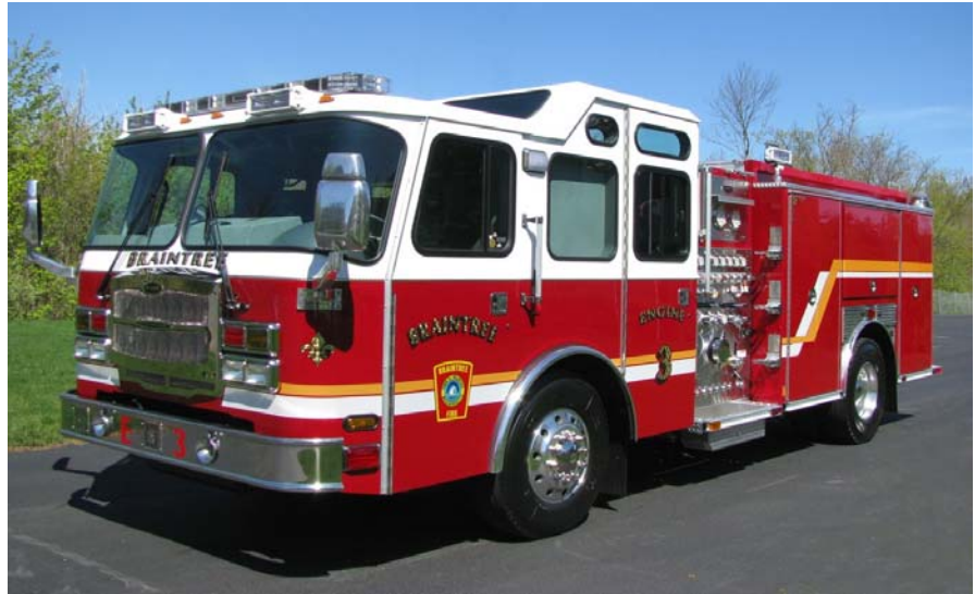
Braintree Engine 3